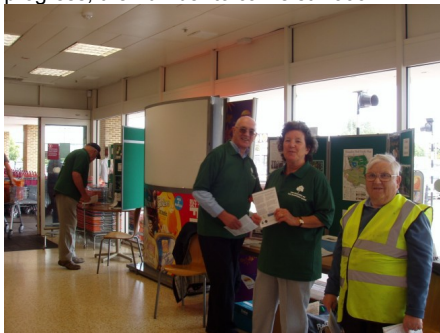
Volunteers in Sainsbury's Foyer

I'm delighted to report that, thanks to our Neighbourhood Police team, year on year crime is down in the whole of the Hampden Park area but, once again, we have had a spate of vandalism in the park. Don't forget if you do see anything the Crimestoppers No is 0800 555 111, it is free and can be anonymous. The new non emergency Police no. is 101, but if you see a crime in progress, the number to call is still 999.