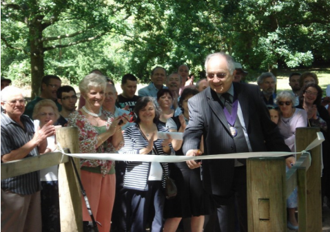
Deputy Mayor cutting the ribbon at celebration event

Well we did it! The works to the pond were completed prior to our celebration event, the sun shone and approx. 150 people attended. A great time was had by all with, conducted walks around the pond to explain all the works; children's treasure hunt; celebratory cake; a balloon race, and the winning balloon reached Holland!!!